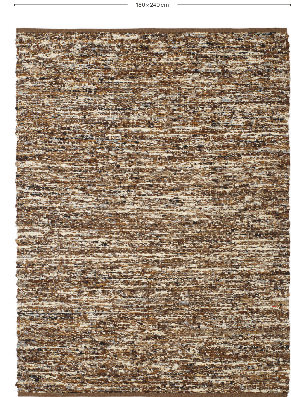
Technicolour Flock 0385