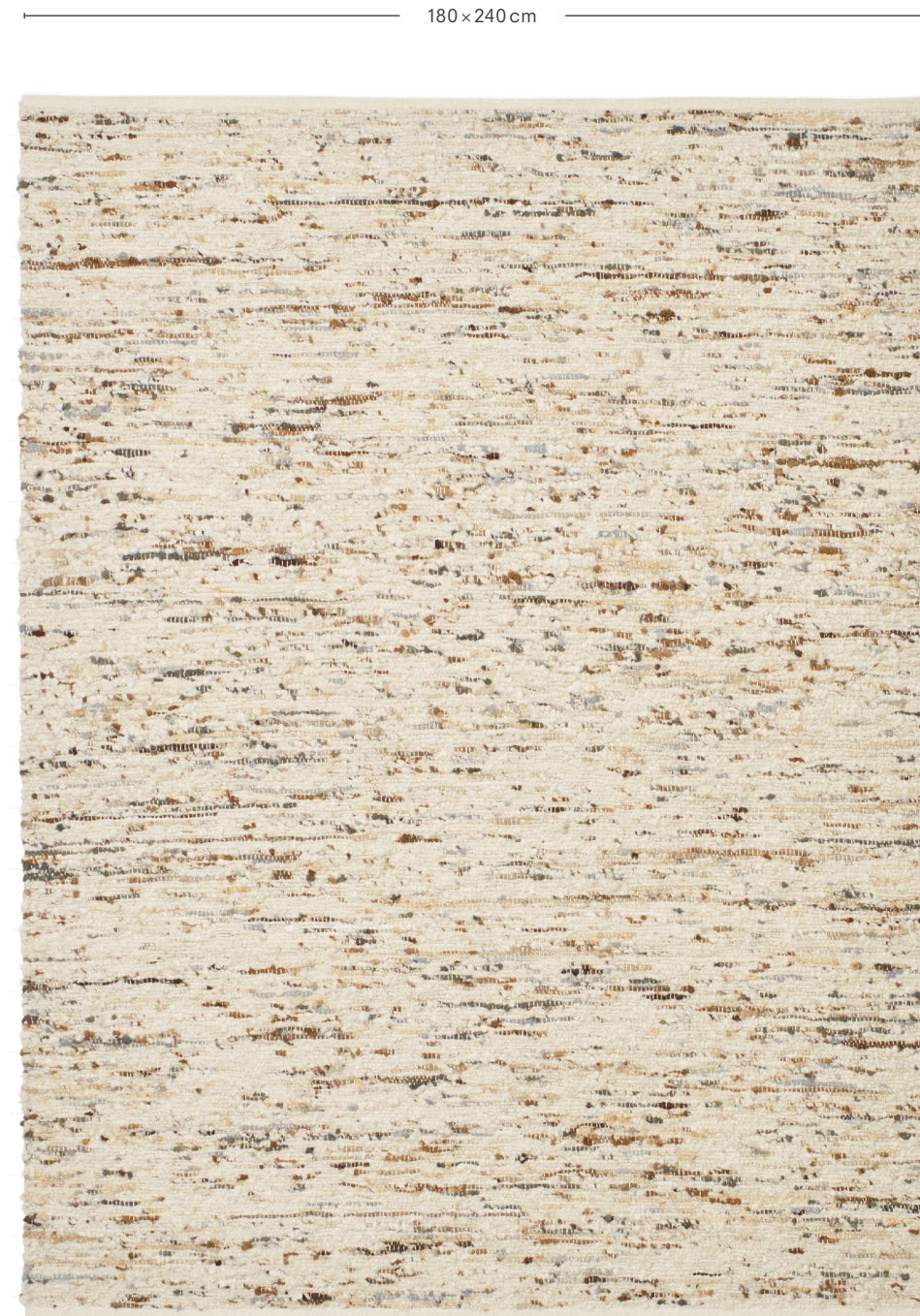
Technicolour Flock 0125

For more information, please visit: kvadrat.dk