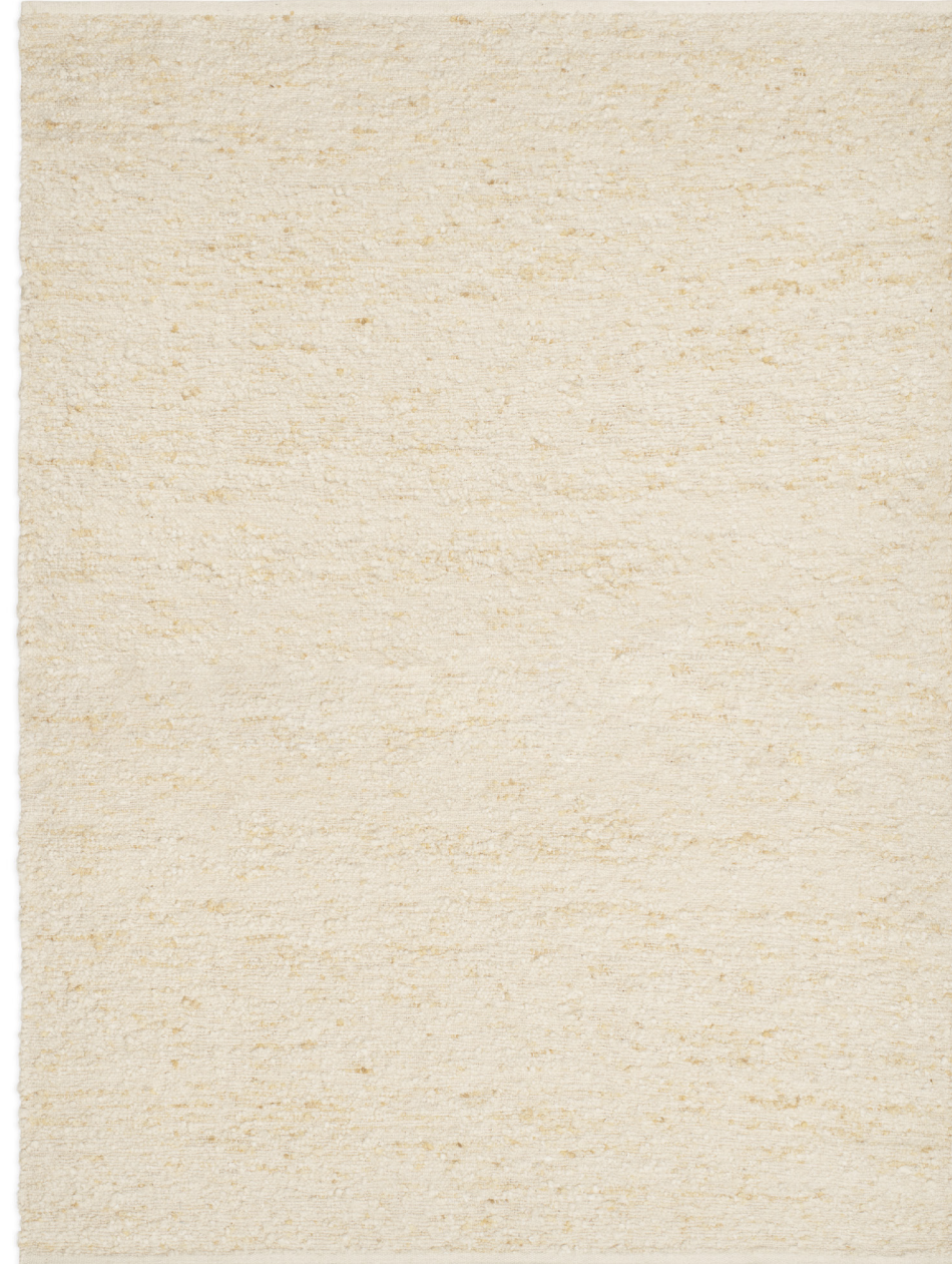
Technicolour Flock 0115