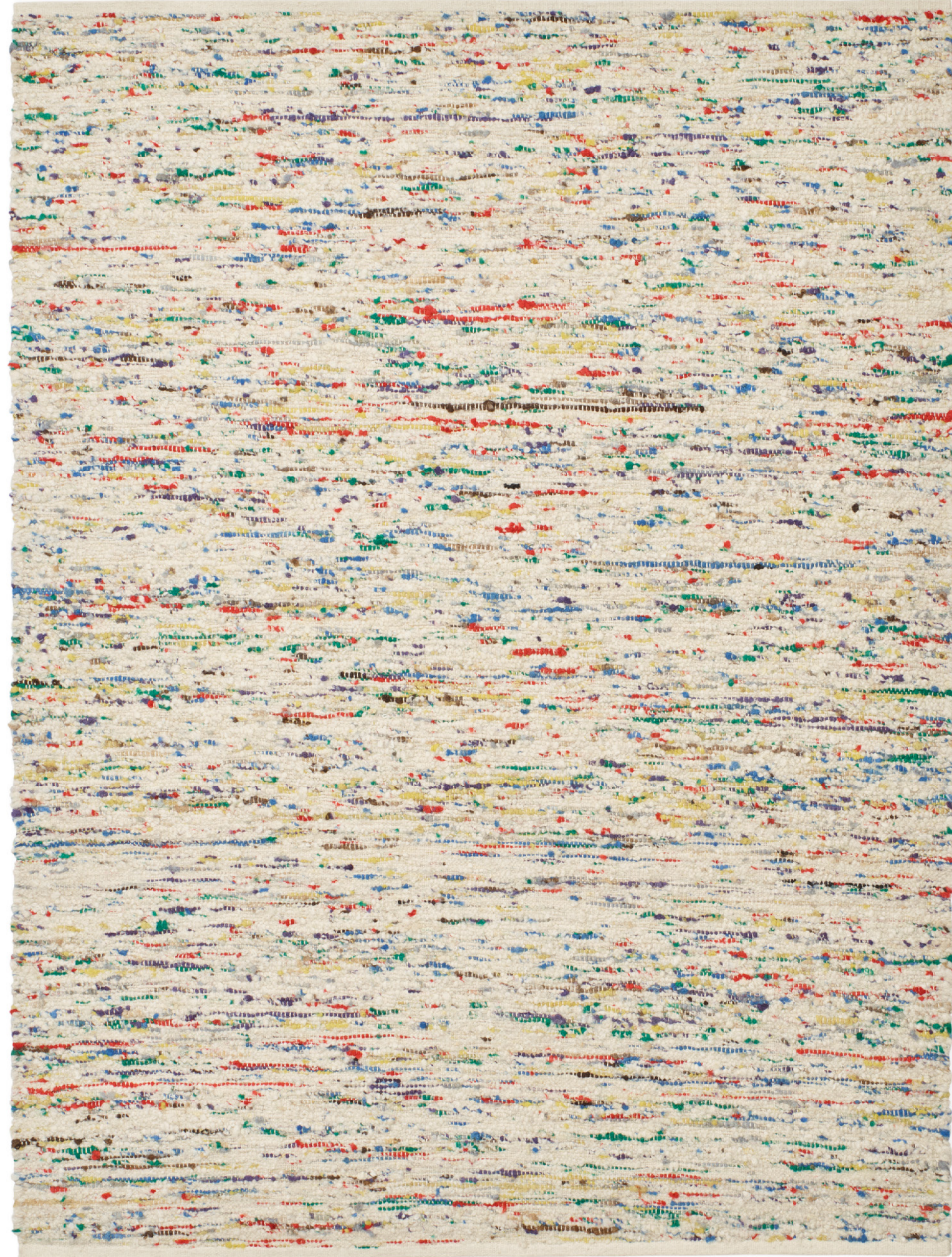
Technicolour Flock 0145